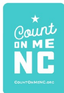
Count on Me NC